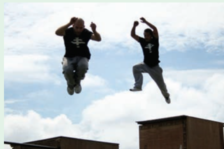
Demonstration by American Parkour Group