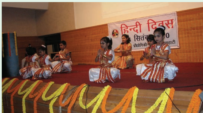
A part of the cultural programme

IIT Guwahati celebrated Hindi Divas on 14 September 2010 with the rest of the country. The event was attended by faculty members, staff, and students of the Institute.