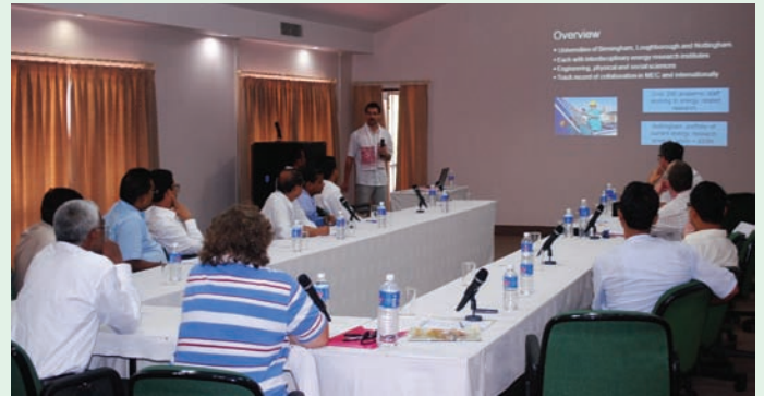
Meeting for research collaboration

IIT Guwahati hosted an interaction session and a lecture-cum presentation on “Internship programme for Indian Diaspora Youth” on 14 September 2010. The programme was organised by the Confederation of Indian Industry (CII), Ministry of Overseas Indian Affairs, Govt. of India in partnership with the Govt. of Assam as the host state. 29 young achievers from 9 different countries, and students and research scholars of IIT Guwahati participated in the discussion.