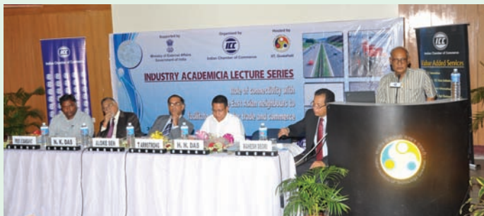
Industry Academia Symposium

IIT Guwahati hosted an industry academia symposium on the “Role of connectivity with South East Asian neighbours to facilitate cross border trade and commerce” in collaboration with ICC, Kolkata and supported by the Ministry of External Affairs, Govt. of India, on 31 July 2010. About 250 delegates comprising members of the top bureaucracy, industry leaders, academicians and research scholars participated in the programme.