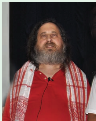
Mr. Richard M. Stallman