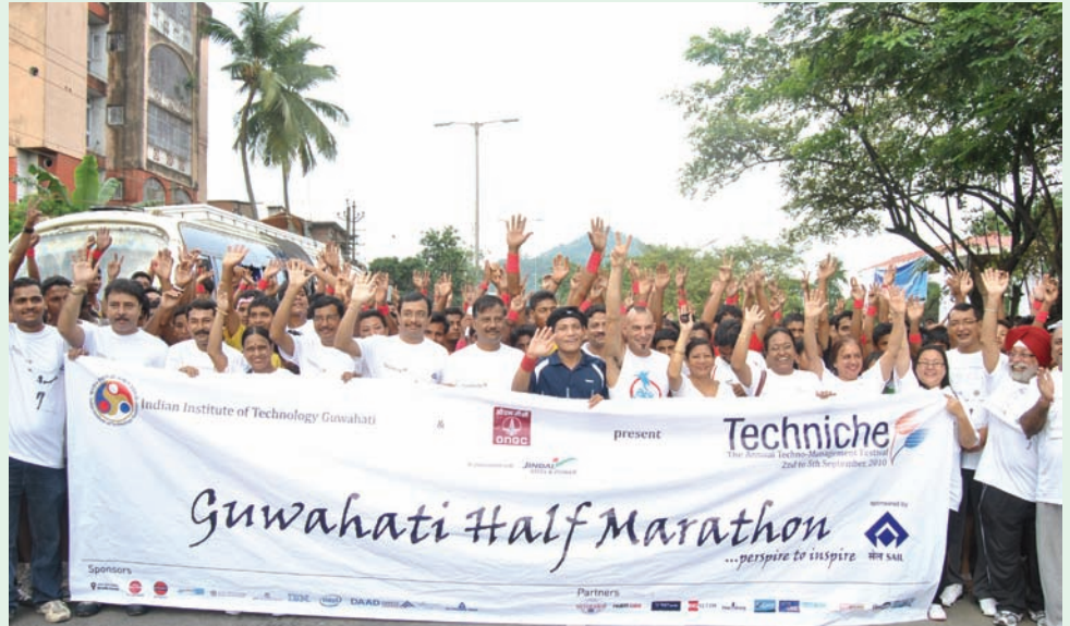
Guwahati Half Marathan

Some of the events Techniche-2010 witnessed were junkyard war, robotics, paper presentations, brain churning quizzes, online events, panel discussions, parliamentary debates, management events, demonstration of the National Disaster Response Force, and the international school olympiad technothlon which had a participation of over 1.5 lakh school students.