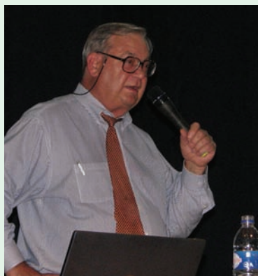
Dr. Ferid Murad