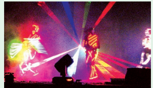
Artistes performing during the Laser Show