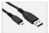
USB Micro Cable