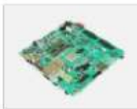
ZCU102 Evaluation Board Featuring the Zynq UltraScale+ XCZU9EG-2FFVB1156 MPSoC