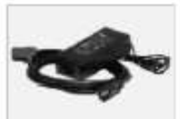
Power Cords and Adapter